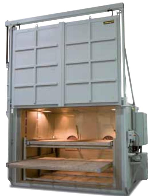
N 12012/26 HAS1 according to AMS 2750 D

As an alternative to instrumentation with the Nabertherm Control Center (NCC) and PLC controls, instrumentation with controllers and temperature recorders is also available. The temperature recorder has a log function that must be configured manually. The data can be saved to a USB stick and be evaluated, formatted, and printed on a separate PC. Besides the temperature recorder, which is integrated into the standard instrumentation, a separate recorder for the TUS measurements is needed (see page 68).