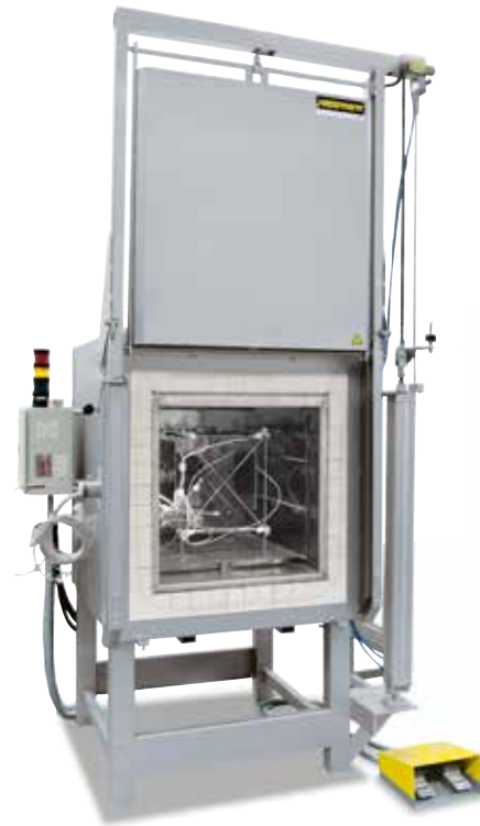
Holding frame for measurement of temperature uniformity

In standard furnaces a temperature uniformity is guaranteed as +/- K without measurement of temperature uniformity. However, as additional feature, a temperature uniformity measurement at a reference temperature in the work space compliant with DIN 17052-1 can be ordered. Depending on the furnace model, a holding frame which is equivalent in size to the work space is inserted into the furnace. This frame holds thermocouples at 11 defined measurement positions. The measurement of the temperature uniformity is performed at a reference temperature specified by the customer at a pre-defined dwell time. If necessary, different reference temperatures or a defined reference working temperature range can also be calibrated.