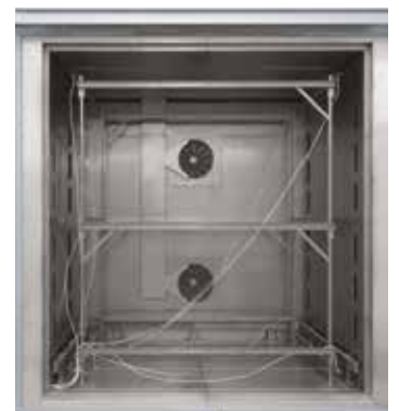
Pluggable frame for measurement for air circulation chamber furnace N 7920/45 HAS